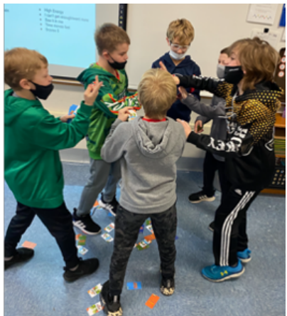
Miss Barnes' 5th grade playing Happy Salmon to decide if they are "Body Smart."