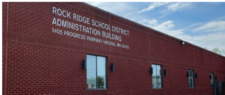
The Superintendent, Business Office, Human Resources, and Director of Maintenance are all located here along with our school board meetings.