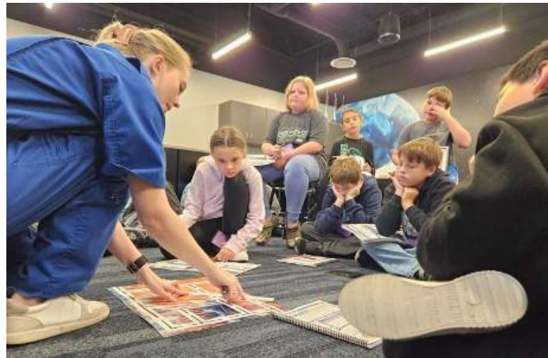
Creating a color coded path for our mini robots to travel.