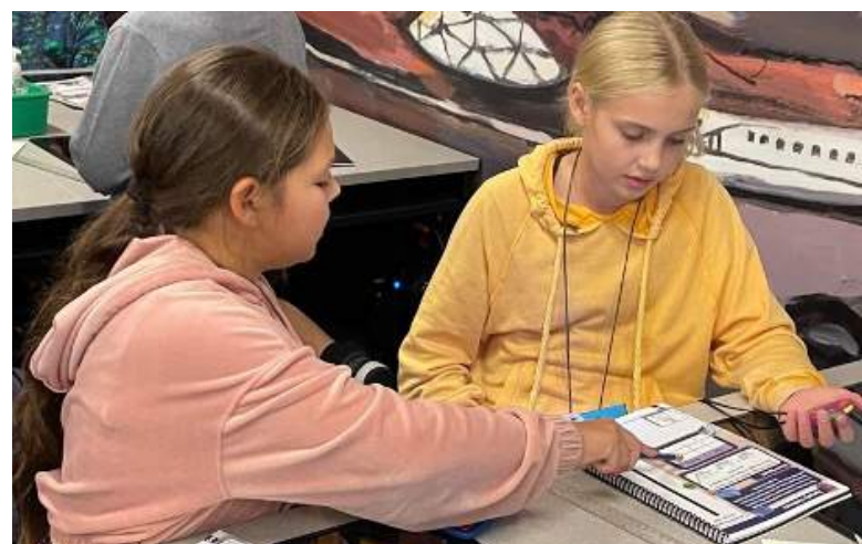
Calculating the rate of the mini robot. Lots of math being used at STARBASE!