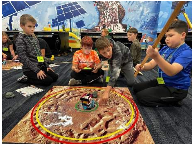
Problem solving as a team - calculating the angle of the rover's turn and how many wheel rotations to move to clear the rocks off the Mars colony site.

The fifth graders were sorry to see the week come to an end. Many expressed interest in returning to STARBASE during the summer to attend STARBASE Summer STEM Camp.