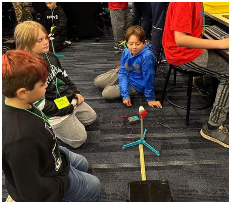
Using wind turbines to measure wind energy needed for our Mars colony.