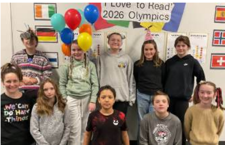
Hats off and 'Howdy' were the greetings for the day when western apparel was requested. And a dress-up week is never complete unless we all "Dress our Best" - Fab Friday!